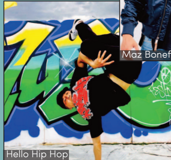
Hello Hip Hop