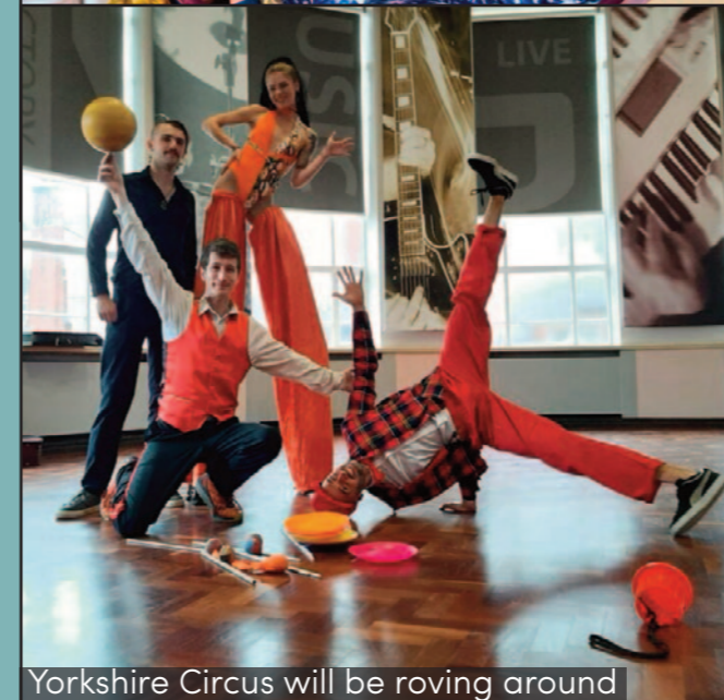
Yorkshire Circus will be roving around